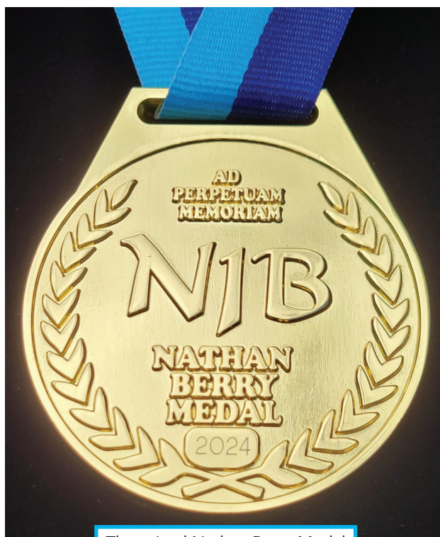
The prized Nathan Berry Medal